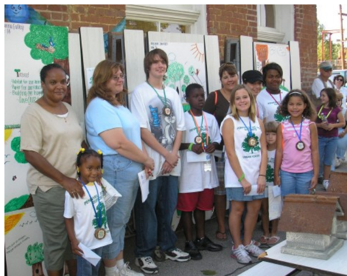
NatureFest " Why we need Trees " Poster contest winners 2008

Please mail your contributions to : Charles Turner ,Pennyrile RC&D 3237 Eagle Way Hopkinsville, KY 42240