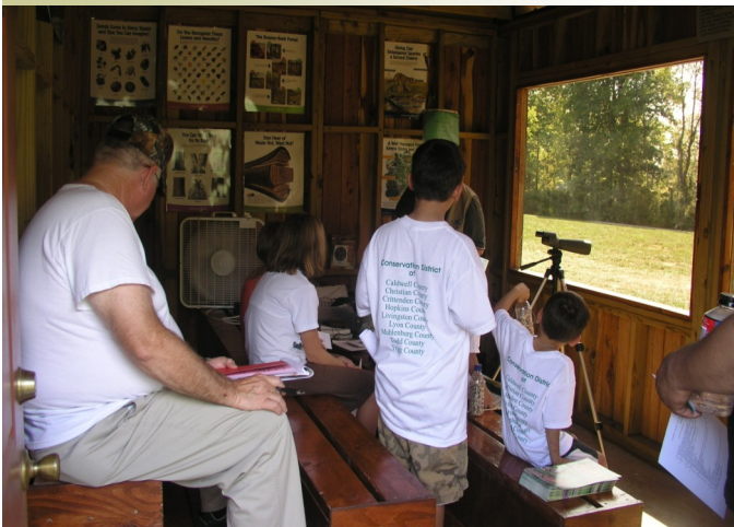
Wildlife Observatory being used by students and adults